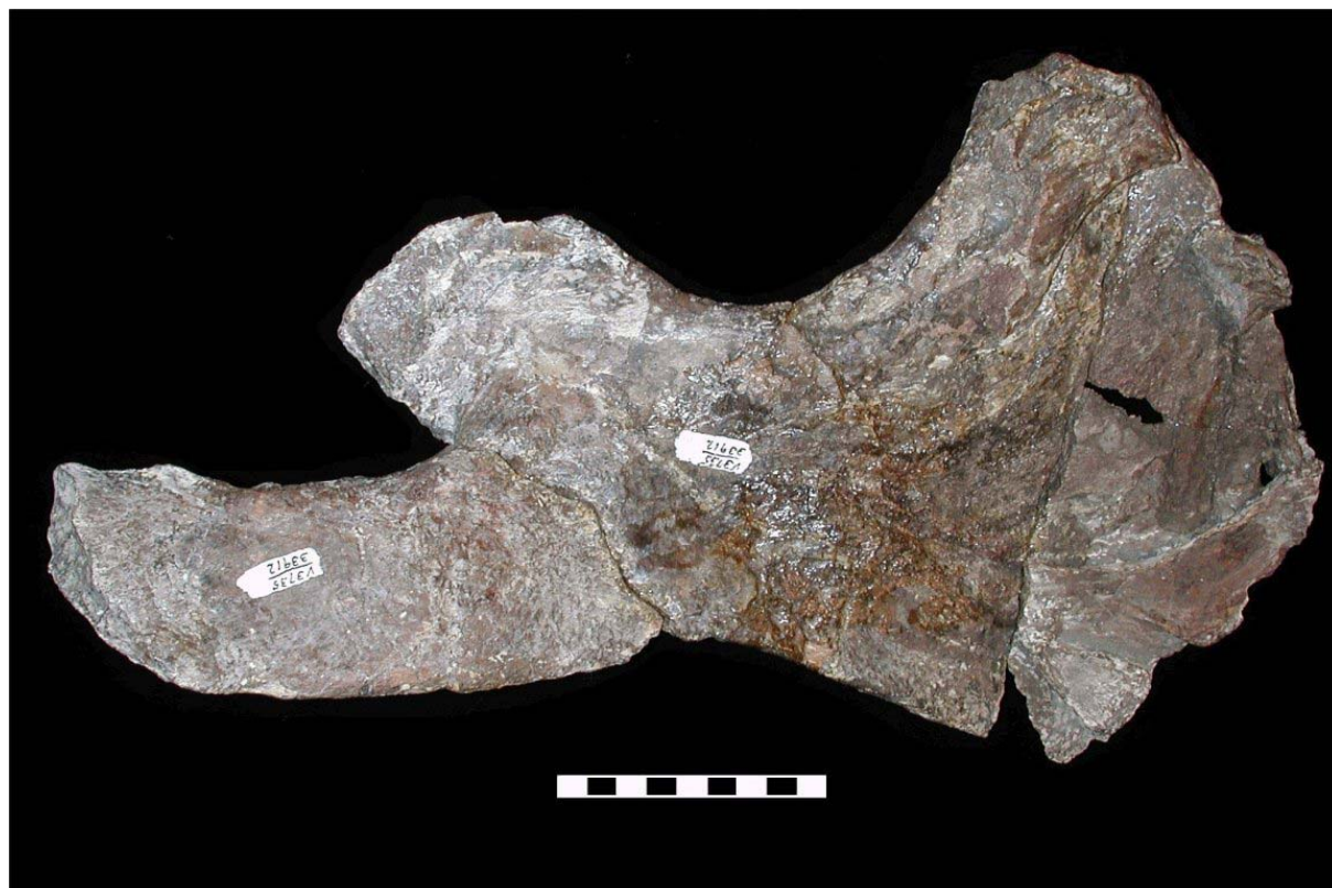
Figure 2. UCMP 33912, right scapula in dorsal view. Scale bar unit = 1 cm.

In Welles (1962, figure 20), however, the scapulae are figured in a different way without explanation. The revised figure shows a laterally widely diverging gap in the area of the scapula-coracoid contact so that only the medial-most corners of the coracoidal and scapular articular surfaces are in connection and the scapulae touch each other anteromedially over a long distance. Welles probably suggested that because of the large rugosities, a prominent cartilagenous area was established here (see also Welles, 1943: 141). As other articulated pectoral girdles demonstrate, e.g. Styxosaurus glendowerensis (RMF R271, Sachs, 2004) and Hydralmosaurus septimanicus (AMNH 1495, Welles, 1962, figure 16), the scapulae and coracoids had no bony contact in elasmosaurids, but the distance between these bones was rather small, indicating that the suggested cartilage layer (Welles, 1943: 141) was not too prominent.